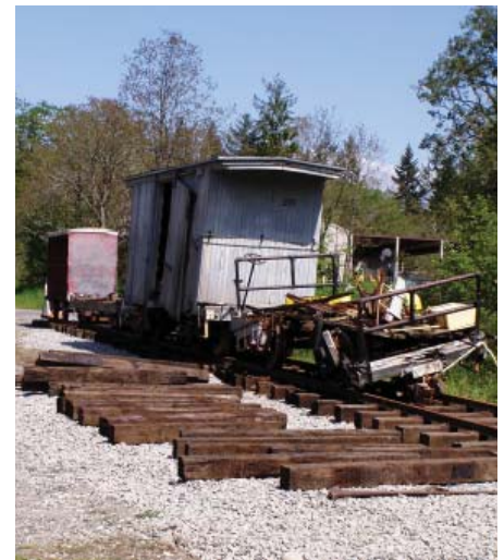
In May of 2007, volunteers helped restore a portion of the 36" narrow gauge railroad directly behind the Museum.