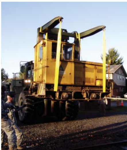
Fort Lewis's 593rd Sustainment Brigade helped deliver DuPont's Historic locomotive back to it's tracks on December 20, 2007. The locomotive is a 1941 Plymouth 12-ton engine.